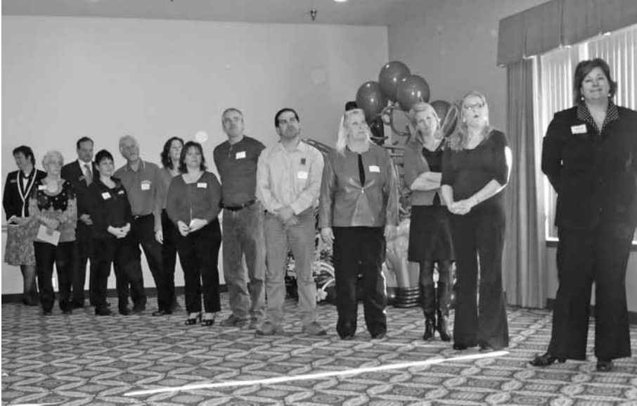
A crowd of new members waits to give their "1 Minute Infomercial" at the January Luncheon.

sponsors, board, ambassadors, and volunteers. We're looking forward to what's in store for 2011.