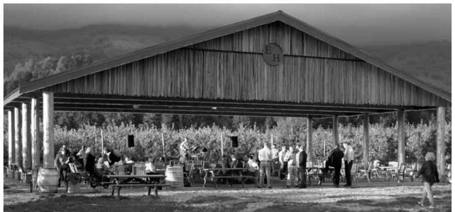
The sun sets on Eagle Haven Winery at the joint September Business Happy Hour & Open House with Sedro Woolley Chamber of Commerce.