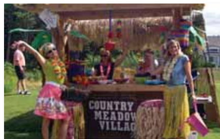
Golfers voted Country Meadow Village as the Best Booth Award Winner at the 2010 Million Dollar Putts & Pints Golf Tournament.