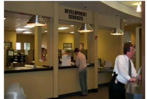
Community and Economic Development Department