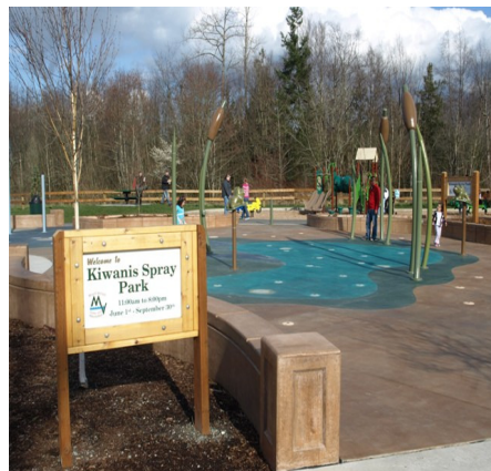
Kiwanis Spray Park

COMMUNITY - Local amenities include extraordinary community spirit, which collectively motivated, has greatly supported our strong tax base, schools, parks, housing, public safety, health and medical services.