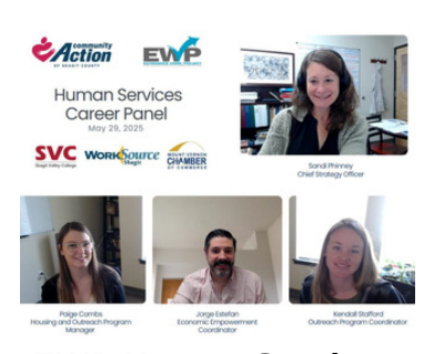
EWP Human Services Career Panel