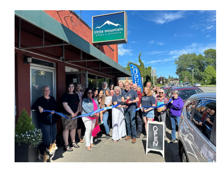
Little Mountain Books and Botanicals Ribbon Cutting