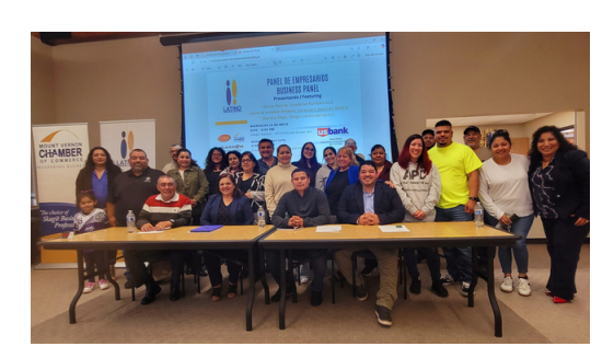
Latino Business Leaders