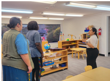
EWP Tour at Escuelita El Jardín