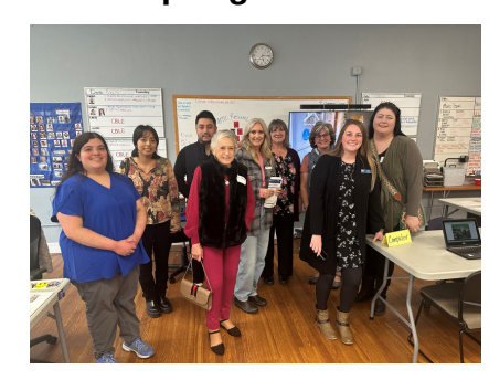
Washington Vocational Services